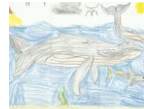
Aysen Shimatsu-Gaspar Age 7, Grade 2 Eleele Elementary School